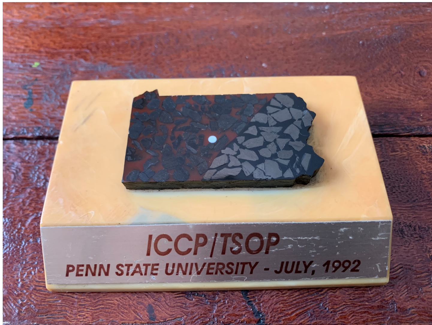
From the depths of TSOP meeting history, a memento from a joint TSOP/ICCP meeting held Penn State University in 1992.