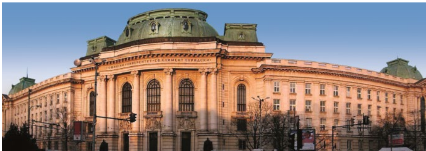
The Sofia University in Sofia, Bulgaria