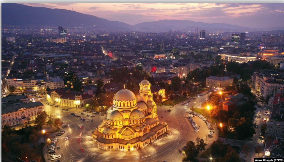
The Aleksandr Nevsky Cathedral in Sofia, Bulgaria