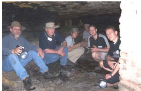
Joadja mine.