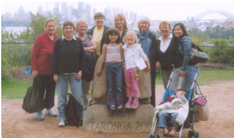
TSOP Partners at Taronga Park Zoo, with Sydney city and the Harbour Bridge in the background.