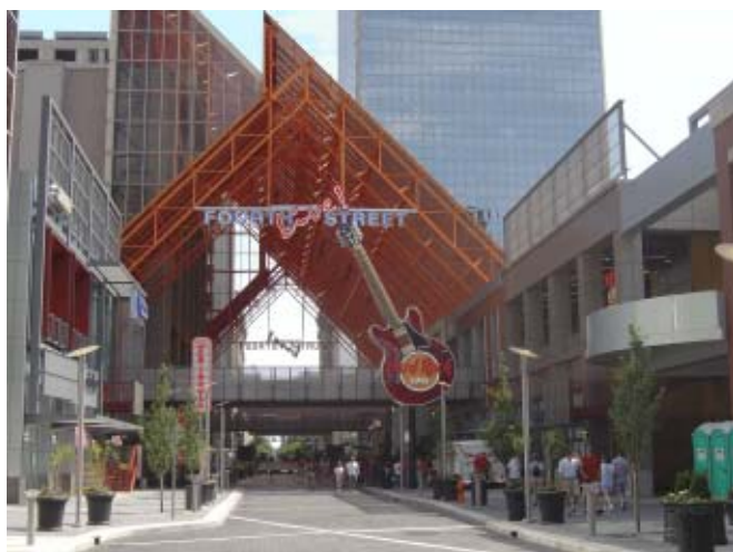
Fourth Street Live

Prior to the meeting, we will conduct a CO 2 -sequestration workshop on Sunday morning. Louisville cannot offer the beach, as did the 21 st TSOP meeting, but we can show you one of the world's largest known Devonian reefs, The Falls of the Ohio. A field trip on Sunday afternoon will take you for a tour of this outstanding geologic attraction, located just minutes from the convention hotel. The post-meeting field trip will visit an underground mine in the Western Kentucky