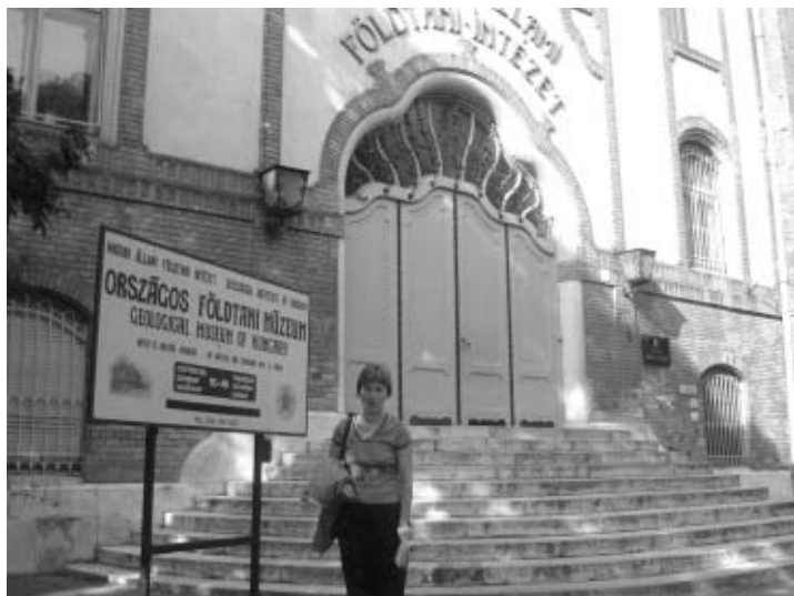
The meeting venue in Budapest.

Social activities of the conference included an icebreaker reception on Sunday, September 12, a guided bus tour on Tuesday, September 14, and the conference banquet at the Stefania Palace on Thursday, September 16. A one-day field trip to northern Hungary concluded the conference.