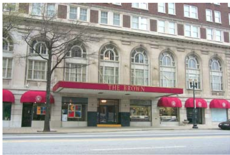
The Brown Hotel, TSOP Meeting venue.